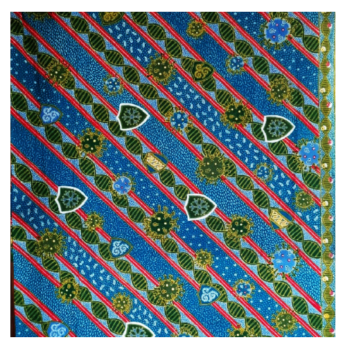
Fig. 6. Corona, a motive made in response to the pandemic situation in Indonesia

such as silat, sedakep , traveling to Pitung's house objects and others. The use of this motive is used for the completeness of men, because their gallant figure and courage symbolize the courage of Betawi men to defend the truth and protect the weak.