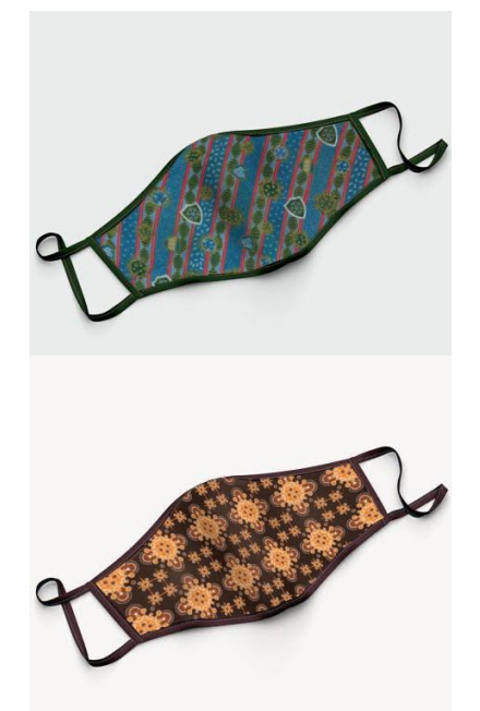
Fig. 7. Corona motif of batik masks, traditional games of the Betawi people

Applications in other forms, namely in masks that are sold as face coverings during a pandemic, this is also an attitude and form of moral messages for the community during a pandemic to comply with health protocols in pandemic conditions. This responsibility is represented in making mask products that are sold freely as well as a learning medium for the surrounding community.