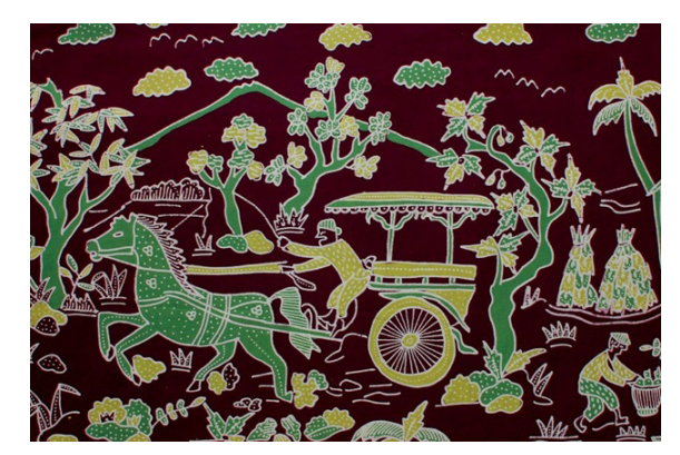
Fig. 4. Nandur , a portrait of the activity of picking rice crops in the fields

The Nandhur motif also shows the daily activities of the Betawi people, namely farming, maybe this activity is rarely found in the inner / city Betawi area, but if it is traced in the Karawang area, the tradition of rice fields is still practiced