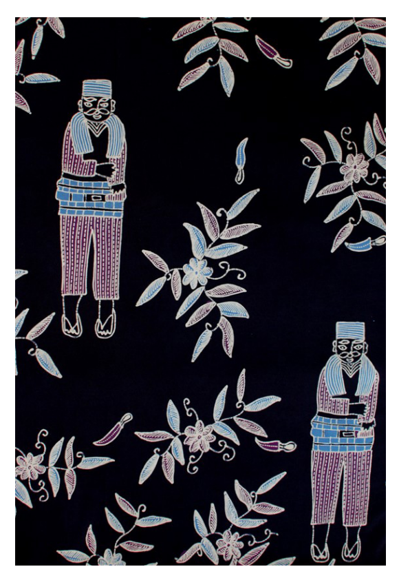
Fig. 5. Pitung Sedakep , the figure of pitung in an idle attitude

even though it is not only done by the Betawi people. This portrait is also a paradoxical value in the perception or image of Betawi, who are known to live in Jakarta. Jakarta is closely related to modern think, a busy capital city, full of tall buildings, but on the other hand what is revealed in the batik in the Betawi area on the outskirts of aatu outside is not only urban modesty, but there is another meaning, where they want to be known as ethnic groups who have culture, has a tradition like in other areas, not only the cities and traffic jams are known, but there are aspects of the visual data record that will be placed in this motif, namely showing the real humanist side of the Betawi people, who still love the natural surroundings.