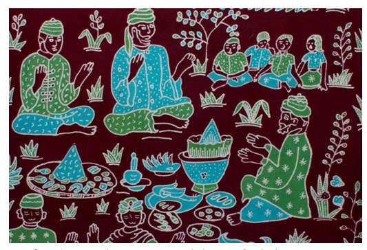
Fig. 1. Baritan , a tradition of giving thanks to the Betawi people

printing techniques. Batik centers in the Cilandak, Gandaria and Bekasi areas have developed motifs that are characterized by Jakarta and Betawi ethnicity, such as ondel-ondel, tanjidor, masks, monas and others. The batik center in the Cilincing-Marunda area develops more contemporary motifs, because the targeted segment is the upper middle class, so that the patterns and motifs and functions are more ceremonial activities and motifs that are closely related to the visual characteristics of the city. 'and modern imagery. Below is a description of the findings of batik motifs from various regions in Jakarta originating from the Betawi people.