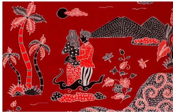
Fig. 3. Demenan , a young couple making out in a field.

rural areas, where the surrounding natural scenery is a suitable place for them to make promises and arrange their future. Nature and a rural atmosphere that is thick with lush vegetation and various types of flora and fauna are often elements in enriching the ornaments and batik motifs found. This is a sign that the Betawi people are close to the natural environment, nature is an idea and a reflection of time and time markers. This was also expressed in the interview, where they gave the theme not based solely on recording, but there is concern if future generations do not know what constitutes the culture that must be preserved.