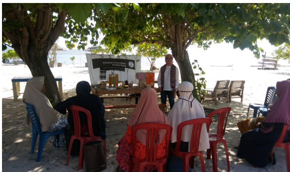
Fig. 8. Training in Liukang Loe September 2020

Another training topic is how they market their products through digital media. They practice using applications on mobile phones, and practice displaying their products in order to attract consumer interest.