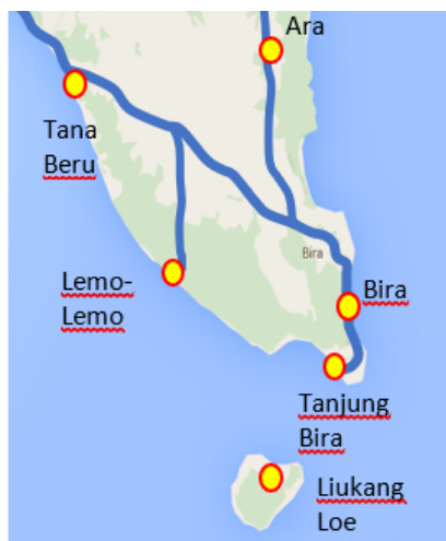
Fig. 2. Liukang Loe Position