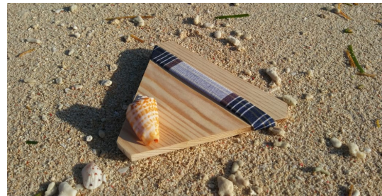
Fig. 6. Glass Coasters