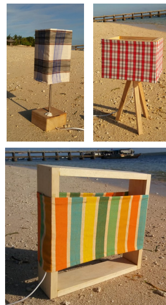
Fig. 7. Lampshade Design

Wood can be obtained from the remains of a pinisi boat. Shellfish are found on Liukang Loe Island, and are woven by local craftsmen. The glass coasters design can be seen at Figure 6.