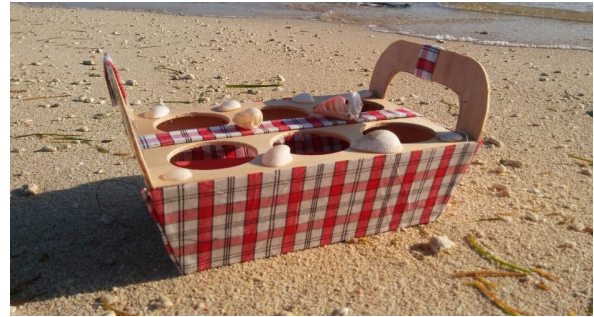
Fig. 5. Mineral Water Container

One of the products that can be developed is glass coasters made of wood, shells and woven materials. These three materials can be obtained around Tanjung Bira and Liukang Loe Island.