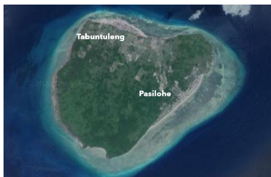
Fig. 3. Liukang Loe Island

In Indonesian culture, weaving is a craft specially done by women.