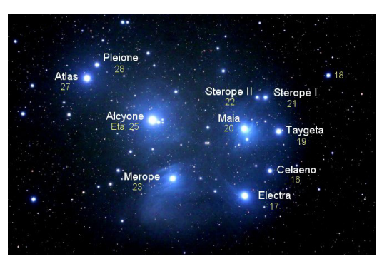
Fig. 2. Pleiades – Seven Sisters