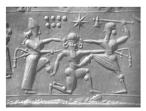
Fig. 3. Pleiades - Mesopotamia https://norcohumanities.wordpress.com/2014/01/28/the-slaying-of-humbaba-9th-c-bce/