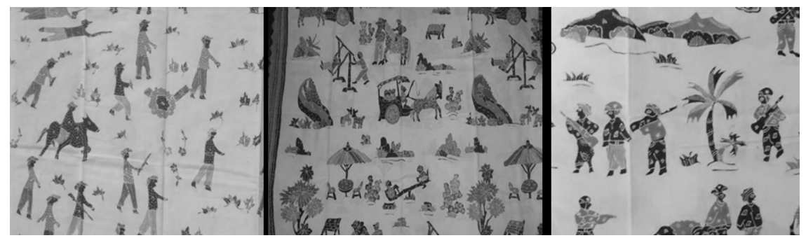
Fig. 3. The Batik Pattern image tells the story, the development of batik Kompeni motifs, tells the story of the daily life interactions between the Dutch Company and local residents (Batik Cirebon).

orally. The notion of mythology in Indonesia is divided into three understandings, the first is true folklore, where humans try with their imagination to explain natural phenomena / forces of nature / occult / mystical. Therefore, folklore in Indonesia is often associated with spirituality, the occult and the mystical. When Hinduism affects the beliefs of the local community and is associated with Indian Hindu beliefs, it then affects the way of thinking of Indonesians. The imagination of natural phenomena has turned into folklore-folk tales by marrying the Mahabharata story into wayang story characters adapted to local life to become role models for Javanese people who are aligned with local beliefs, into folk tales through the form of West Java Wayang Golek, Wayang Cepak Cirebon, Wayang Kulit Solo and Yogjakarta, Wayang Kamasan Bali. [1] (Adisasmito, Nuning, 2007).