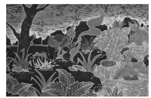
Fig. 6. Batik tells the myth of Jaka Tarub (Yanmi Art Studio Batik)

The development of Batik coastal motifs includes the influence of European and Chinese fairy tales. This causes Batik artists to bring up lo-