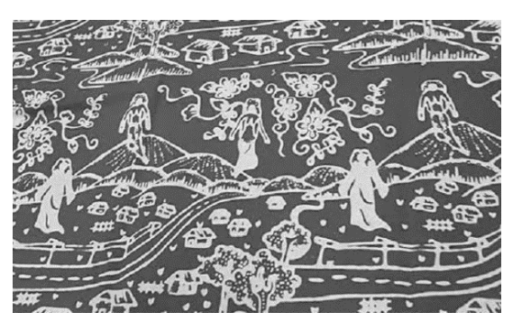
Fig. 7. Batik style tells the story of the Wewe Gombel myth. (Batik Semarang)

cal myths and legends. The characteristic of coastal batik can be seen from the motifs that symbolize the acculturation of coastal Indonesian culture with foreign cultures. Cirebon coastal batik has progressed during the 1800-1900s period.