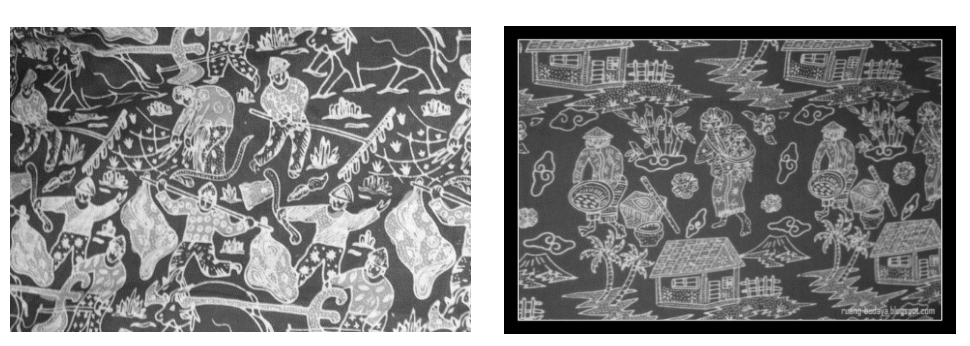
Fig. 4. The Batik Pattern image tells the story of developing company motifs, seeding, planting rice until harvesting, and selling the award crop to Dewi Sri, Dewi Padi. (Batik Cirebon). (Repro: Nuning Damayanti)

The Cirebon region is a coastal city that frequently visited by foreigners, resulting in a process of mixing external cultures with Cirebon's indigenous culture. Cirebon batik motifs greatly influenced the decorative patterns of batik which experienced its heyday, especially at the time of the entry of Islam in the 15-16 centuries. The variety of non-figurative flora becomes an alternative in coastal batik motifs because it may be because of the prohibition among Islamic scholars in drawing figurative formsThe peak of the development of coastal batik was during the era of Indo-Dutch entrepreneurs who played a role in the batik business. Not only entrepreneurs from the Netherlands, Chinese entrepreneurs also took part in the development of coastal batik. North of the island of Java. Coastal batik has the following characteristics: Batik decoration is decorative for