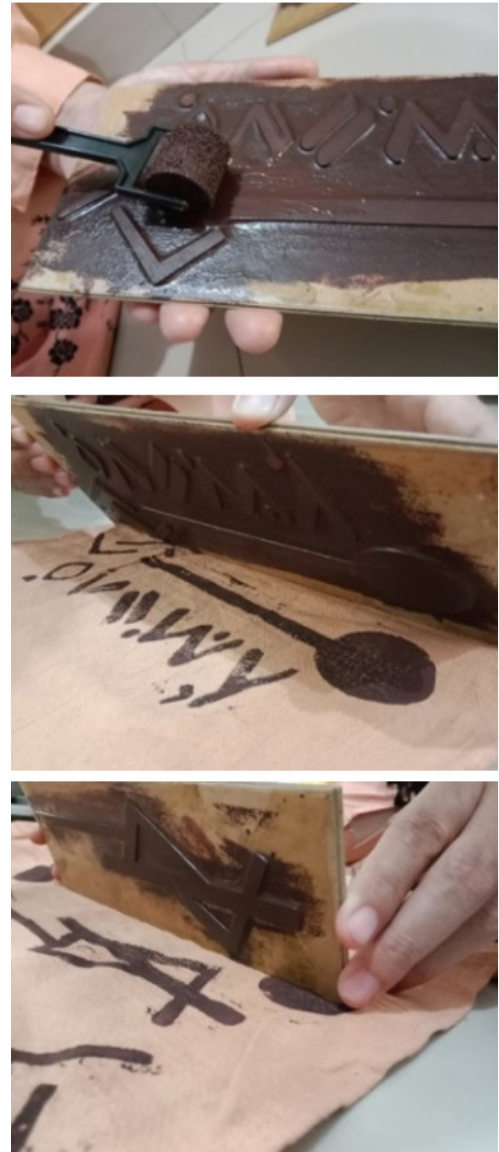
Image 1. Rubberblock Print Technique Source: Personal Documentation, 2022)