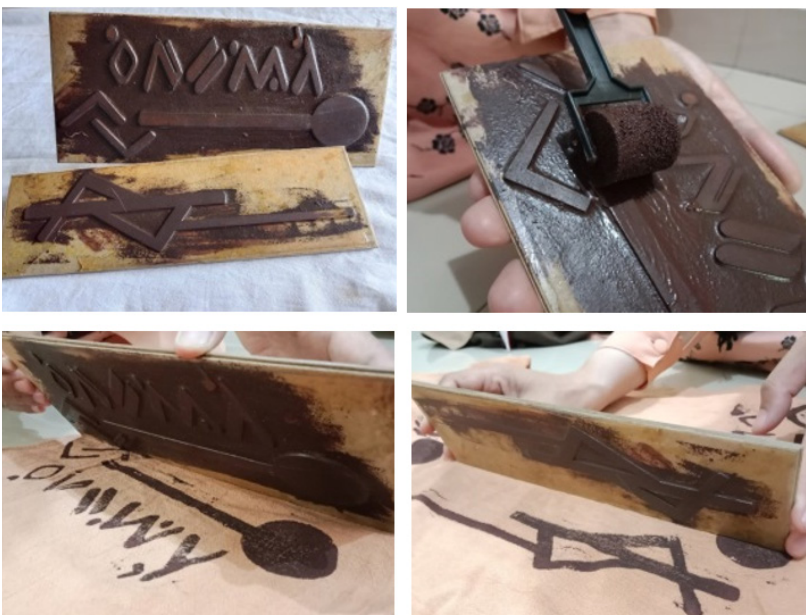
Image 7. the process of applying motifs with the Rubberblock Printing technique