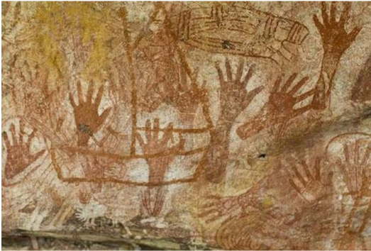
Image 2. Pictures of corrosion on cave walls