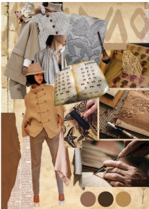
Image 3. Moodboard designing Fashion Outer

The problem in the development of the era to preserve the archipelago's heritage is the script; Lotara script became an inspiration in the exploration of various ornamental designs, which were applied to the fabric's surface as an educational medium. In addition, as one of the concerns about the environment and development of the ecosystem, this design uses natural materials, such as RubberBlock Printing and Natural dyes.