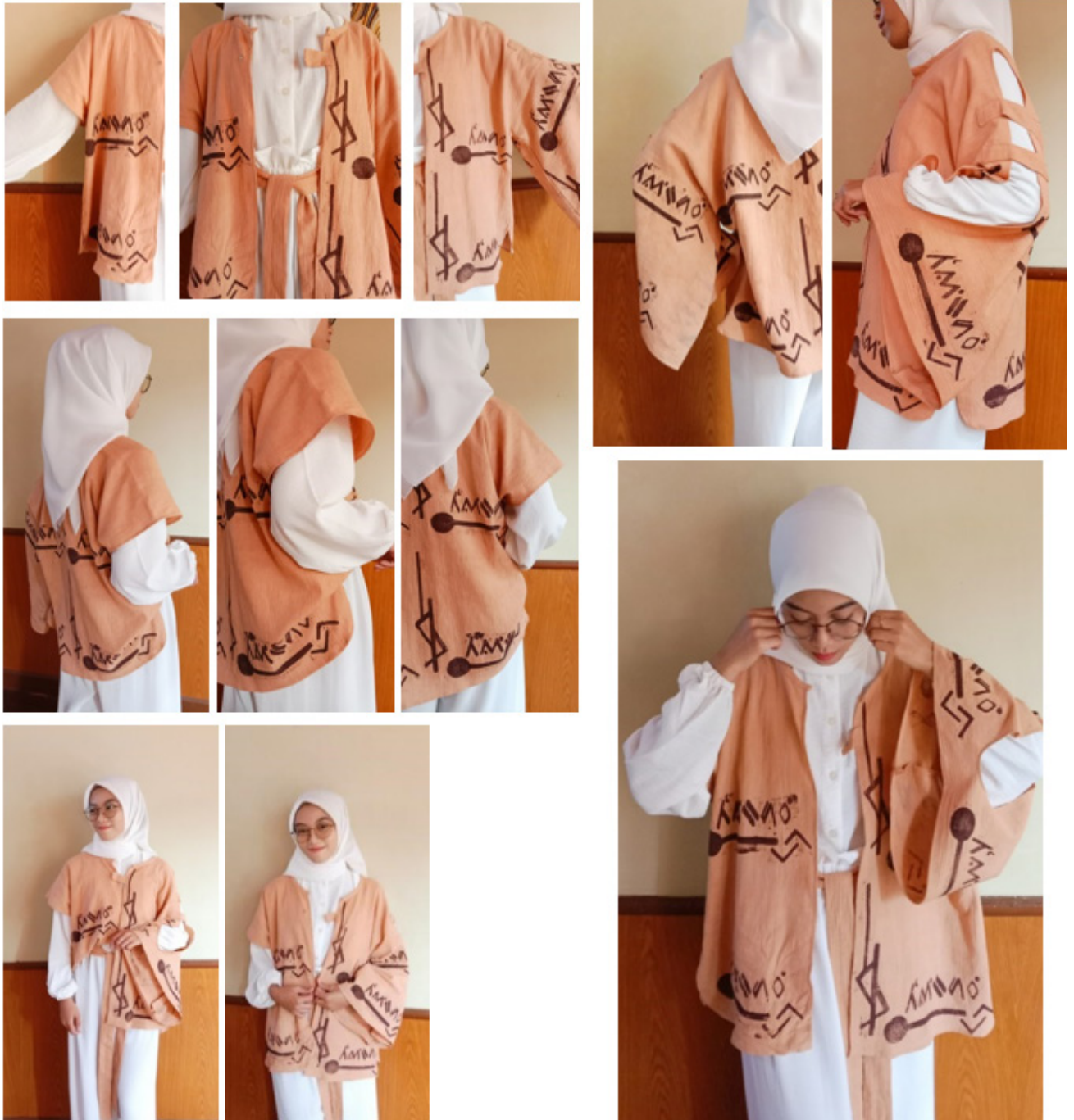
Image 7. Mockup results in da color selection