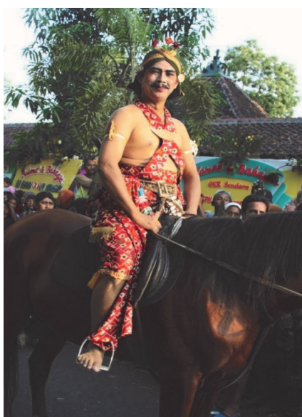
Image 1. One of Lawung Gagah dancers is riding a horse, from the palace to Bangsals Kepatihan

The dance is also called Beksan Trunajaya because it is inspired by the background of social-political situation at that time. The Sultan greatly admired the heroism of Trunajaya, a prince of Madura who persisted against Dutch colonialism in Java, so that the image reflected in the dance, wanted to instil a brave attitude against the enemy. Besides, the name of Trunajaya can also be suspected because, at that time, this dance was performed by a palace soldier named Corps Nyutra section of Trunajaya (Suryobrongto, 1981: 32). When it was still in a situation of upheaval against invaders, especially in Java many joined the soldiers from Madura and Bugis, so that the purpose of the dance creation is to arouse cou-