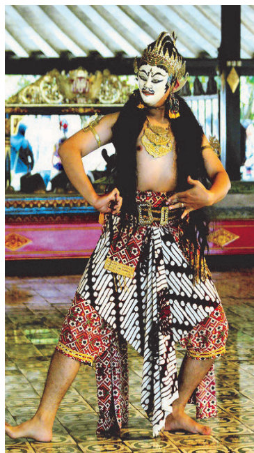
Image 8. Klana Topeng Alus or Klana Gunungsari

comes a symbol of the palace. The costume of this garuda character is unique which was created since the reign of Sultan Hamengku Buwono VIII (Hadi, 2013: 135-136).