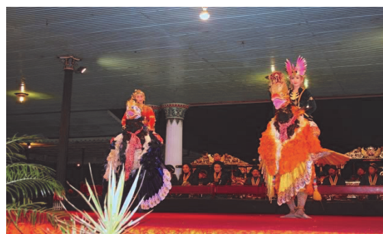
Image 6. Beksan Golek Menak Putri Dewi Adaninggar (left) – Dewi Kelaswara (right); riding Garuda bird. The performance was in Keraton Yogyakarta