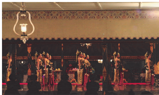
Image. 3. Bedhaya Harjunawiwaha in Rakit Kapang-kapang majeng was performed at Bangsas Kencana, on Pahargyan Jumenengan Dalem, and Tumbuk Ageng Kelahiran Sultan HB X