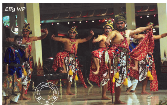
Image 2. Beksan Lawung Gagah was performed at Bangsals Kepatihan , Wedding ceremony of Sultan HB X (GKR Bendera) princess

In addition to Lawung Gagah dance as a dance, which is characterized by gagrag Ngayogyakarta , there is also Wayang Wong form and Bedaya dance. Sultan Hamengku Buwono I was also the first to introduce the type of Wayang Wong or dance drama gagrag Ngayogyakarta with a lot of dialogue or pocapan and loaded with the values of the contents of the story. At the first time, Wayang Wong was created by Sultan Hamengku Buwono I with the story of Gandawerdaya , the story of carangan or composition taken from the epic of Mahabharata . Beside aesthetic purposes, creating the performing arts is also influenced by a social and political context. The gandawer's story of power is a depiction of the heroism of the ksatriya in the Mahabharata . This story actually depicts the history of Sultan Hamengku Buwono I himself during a dispute or conflict with his brother Sunan Paku Buwono II , and when it is always mediated by the Dutch with social, economic, and political interests that always harm the palace. In the play, it was told that the characters of ksatriya Gandawardaya and Gandakusuma are actually the same siblings of Ar-