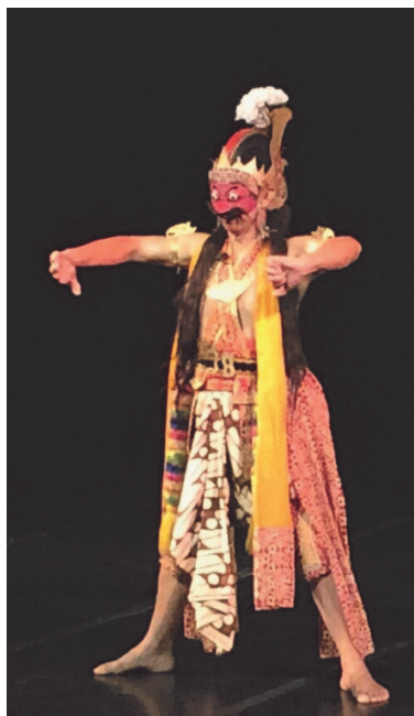
Image 7. Klana Topeng Gagah or Klana Sewandana