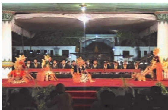
Image. 5. Wayang Wong performance with Ciptaning Mintaraga at Pagelaran Keraton Yogyakarta , in commemoration of Keraton Kasultanan Yogyakarta

macy of Sultan’s empowerment as king in Yogyakarta Sultanate.