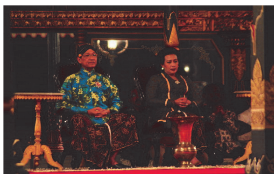
Image. 4. Sultan BH X and his wife GKR. Hemas on Pahargyan Jumenengan Dalem, and Tumbuk Ageng Kelahiran in 2007, were watching performance of Bedhaya Harjunawiwaha