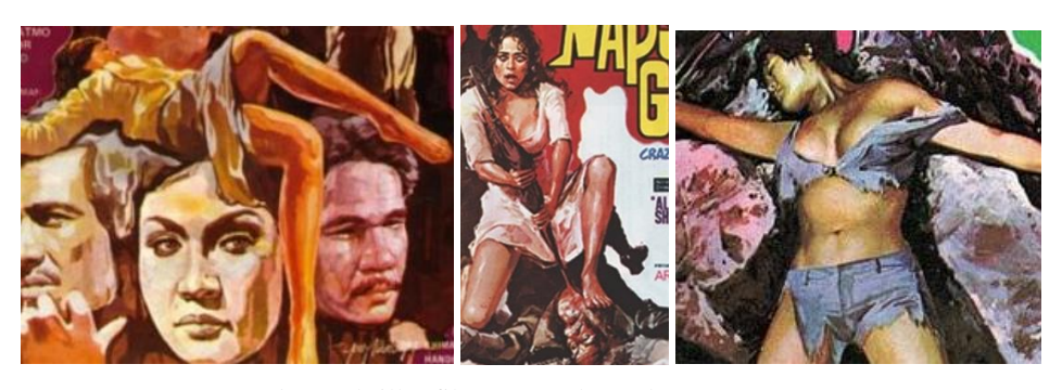
Fig.1. Thriller film poster showed sexy woman

Showing part of breast and thigh become interest to attract the audience who are often used as trigger to blow up the audience's passions. Women's thighs are displayed vulgarly in poster film "Napsu Gila" (1973), "Kafir" (1974) and "Primitif" (1978). In "Napsu Gila", a woman was wearing dress which was lift up caused by her position of sitting. In "Kafir", a woman was laying down and lifting her skirt so the thigh was reveal vividly. Not only showing her thigh, woman in these thriller film posters was showing her cleavage by wearing low collar shirt or dress. Even in film poster "Primitif", the woman nearly naked, she only worn ripped blouse and pants.