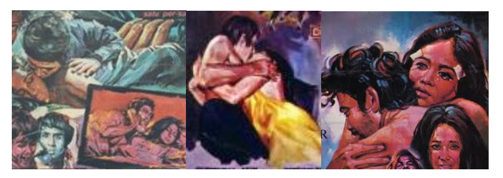
Fig.2. Thriller film poster showed the act of intercourse (Doc: Asidigisianti Surya Patria, Nova Kristiana, Hendro Aryanto)

This arises gender injustice, where women assumed as commodity attraction to be bought. Woman can also be represented as the victim of sexual violence, even when she appears to have agency (Figure 2). In "Napsu Gila" (Crazy Desire; 1973), for instance, the Sexual Woman is shown violently holding a man to the ground and sticking an umbrella to his throat (Woodrich, 2016).