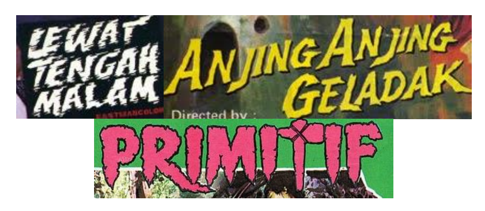
Fig. 3. Thriller Film Poster Typeface (Doc: Asidigisianti Surya Patria, Nova Kristiana, Hendro Aryanto)

The impression of ferociousness is also generated in the decorative and serif typeface by sharpening the edges of memorable letters like a sharp knife as in the title of a movie poster "Dikerjar Dosa" (1974). Typeface used sharp as a knife held by the main actor emphasized with red color applications. So was the poster film "Anjing-Anjing Geladak" (1972) also applied a decorative typeface with serifs that were drawn so that it had a sharp impression. This serves to emphasize that the film shown on the poster is a thriller film.