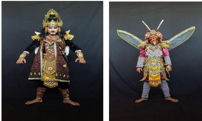
Picture. 1. The Costume of Prabhu Kesiman and Legu Gondong (The Giant Mosquitos). (Doc: Agung Rahma, 2016)